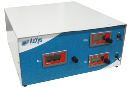
ULG-3 (3 gases mixing)